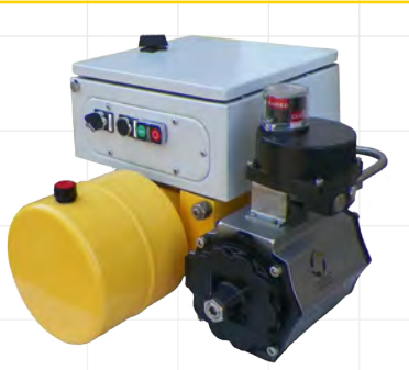
Series 1 version

The assembly uses machined manifolds to divert the hydraulic fluid in and out of the reservoir, pump and actuator eliminating the need for hydraulic hoses.